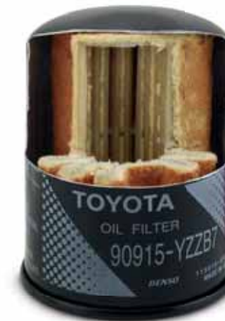
Toyota Genuine part